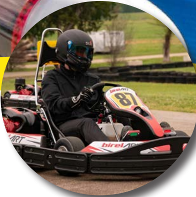
Corporate Retreats and Team Building