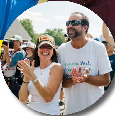
Build Your Own Experience