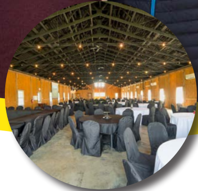
Host Your Event With Us

VIRginia International Raceway 1245 Pine Tree Road Alton, Virginia 24520 www.VIRnow.com