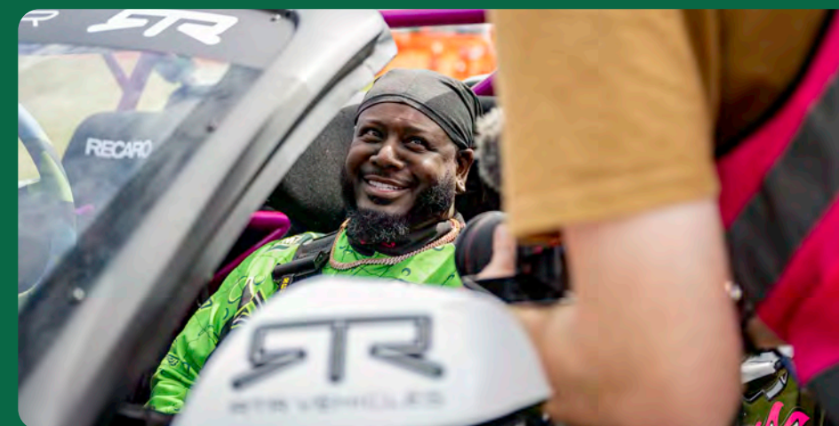
Singer, Songwriter, and Producer T-Pain in his car ready to drift on the Patriot Course during HyperFest